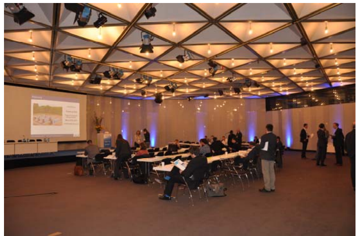
Welcome to the 3rd Conference of Power-to-Gas