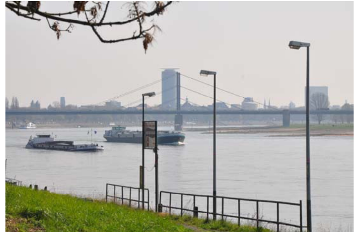
On the Rhine

Hope to see you again in 2015! Energy Storage, 9 th –11 th March, 2015 4rd Conference Power-to-Gas, 11 th March, 2015