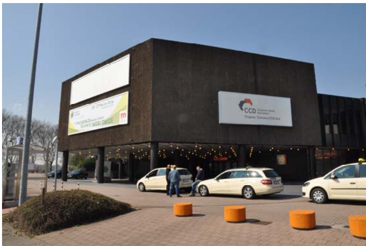
CCD Süd, Düsseldorf – a jewel from the seventies